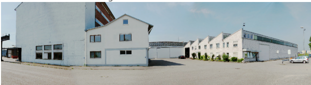
Logistikzentrum in Kehl (harbor)