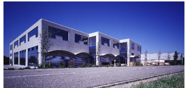
Otto Nußbaum GmbH & Co. KG in Kehl-Bodersweier