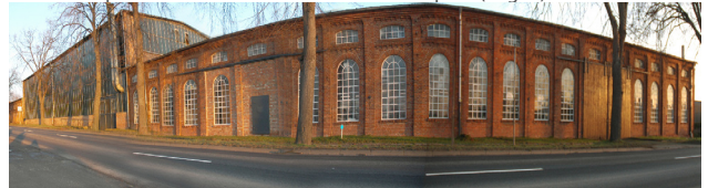
Hydraulik Seehausen GmbH in Seehausen/Börde near Magdeburg