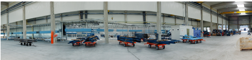
Hydraulik Markranstädt GmbH in Markranstädt near Leipzig · new production hall