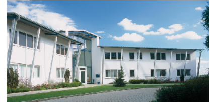
ATT – Automotive Testing Technologies in Kehl-Auenheim