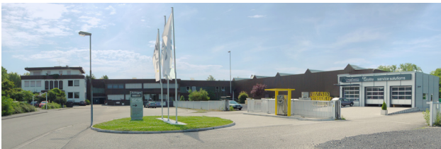
SMT – Sheet Metal Technologies GmbH in Kehl-Sundheim with SCS Station