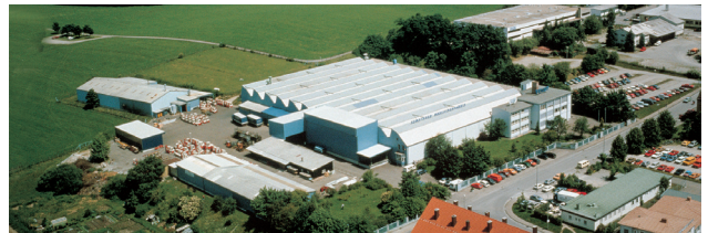
KMF – Kemptener Maschinenfabrik GmbH in Kempten (Allgäu)